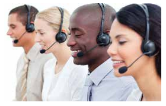
Interpreters available for over 200+ languages

Providing HELP, HOPE, and SUPPORT for people affected by seizures and the epilepsies